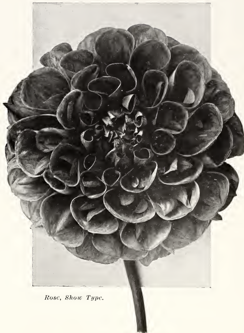
Rose, Show Type.

R. HAGERMAN —Dec. The color is a pure saffron yellow of medium large size with good depth. Bushes grow about five feet in height and blooms are held erect on long, wiry stems well above the foliage ..... .75 ROOKWOOD —Dec. This is one of the finest of varieties in its class. A most consistent prize winner. Blooms early and late. The color is a clear cerise rose with no traces of lavender, that looks like the Russell rose for coloring, under artificial lights. Has immense flowers of good depth held erect above the foliage on splendid stems. Is produced on a low growing bush about three feet high 1.25